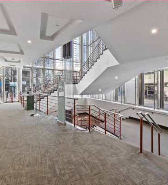
Booth Playhouse (Upper Lobby)