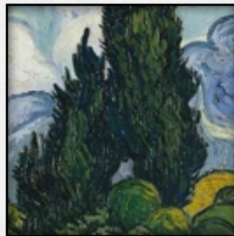
#11 CYPRESS TREE