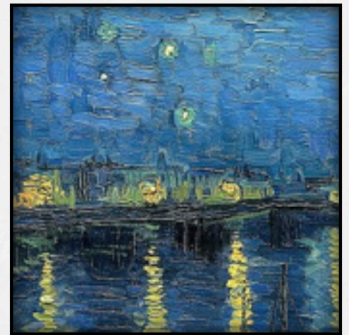
#20 STARS AND REFLECTIONS