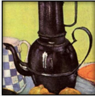
#2 COFFEE POT