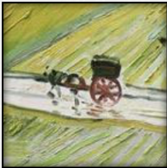
#17 HORSE AND BUGGY