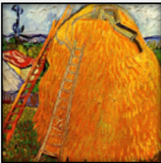
#5 HAYSTACKS WITH LADDERS