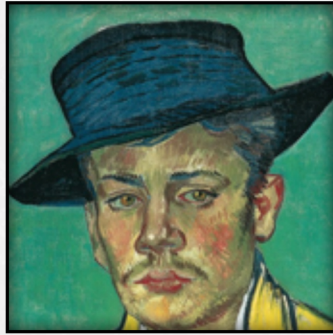
#14 MAN IN BLACK HAT