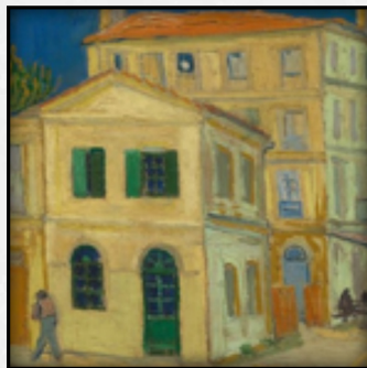
#10 YELLOW HOUSE WITH GREEN SHUTTERS