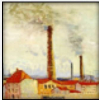
#6 FACTORIES WITH SMOKE