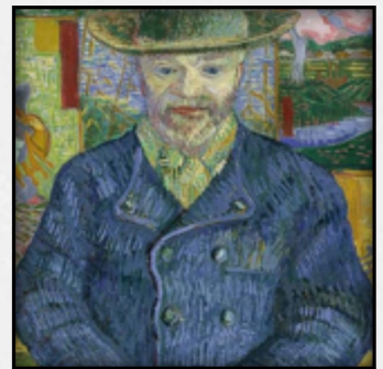
#8 MAN IN BLUE JACKET